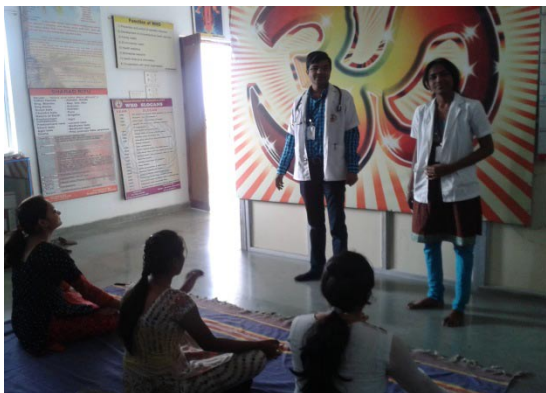
Yogasan & pranayam training for garbhini and Prasuta