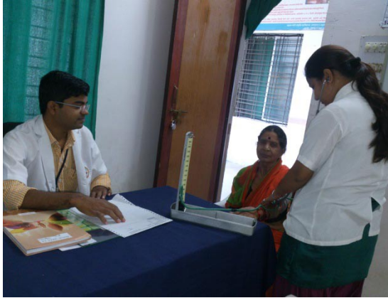
Empathetic Patient care