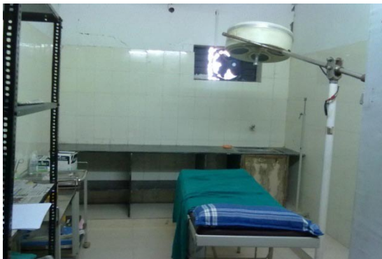
Well Equipped Labour room