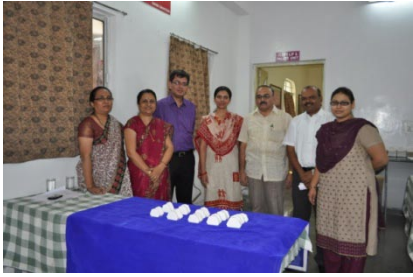
Cleft Orthodontics team